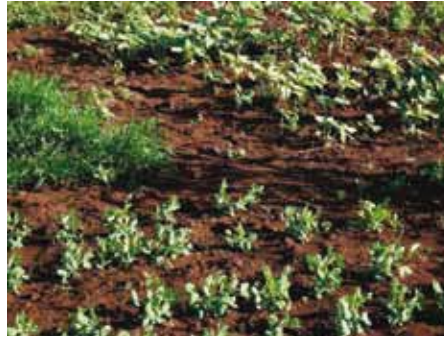
You get more out of a small piece of land if you practise crop rotation.

It will introduce incentives to encourage use of technology and scientific