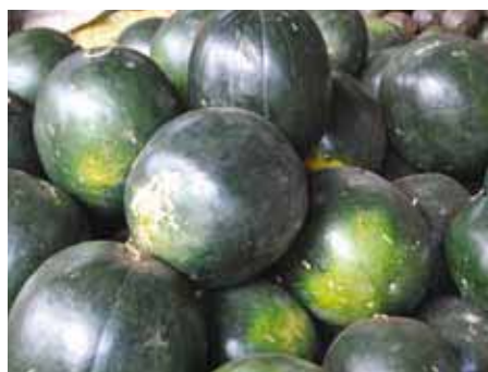
Water melons in a market stall

that may infest watermelons in hot and dry weather. You may use Neem or Tephrosia preparations against cucumber beetles, cutworms or leafhoppers that damage young seedlings or flowers.