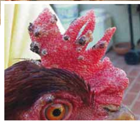
Free range chicken (above). A cock infected with chicken pox (below)

and medicate sick birds or kill them in order to prevent the spread of disease. • Remove dead birds immediately and dispose of them by burning or burying. Do not eat sick birds – some fowl diseases can transfer to human beings in this way.