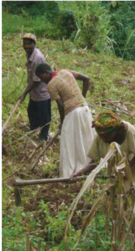
Creating jobs outside farming will reduce pressure on land.

Land is critical to the country's socio-economic and political development.