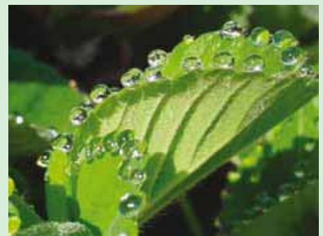
Guttation on strawberry leaves

of them. There can be a third reason: When there is fog and air humidity is high, the water in the air condenses on any surface and forms droplets, also on plants. This is called dew and can often be seen after cool nights. The insects you observed may also just take advantage of this water source – they may need it, especially in the dry season.