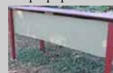
Front side of the bin

The adult BSF lays its eggs in rotting fruits, vegetables, manure or other agricultural waste. Within two weeks, the eggs hatch and turn into mature larvae. Once the larvae have developed completely, through the six stages, they enter a stage called the prepupa. While this stage, they stop to eat, empty their stomachs and their mouth parts change to an attachment that helps in climbing. During this period, they prefer dry sheltered area to pupate. More often, such dry places are in compost bins where self-harvest of the mature larvae can be done. These containers have holes on the sides to allow the prepupae to climb out of the