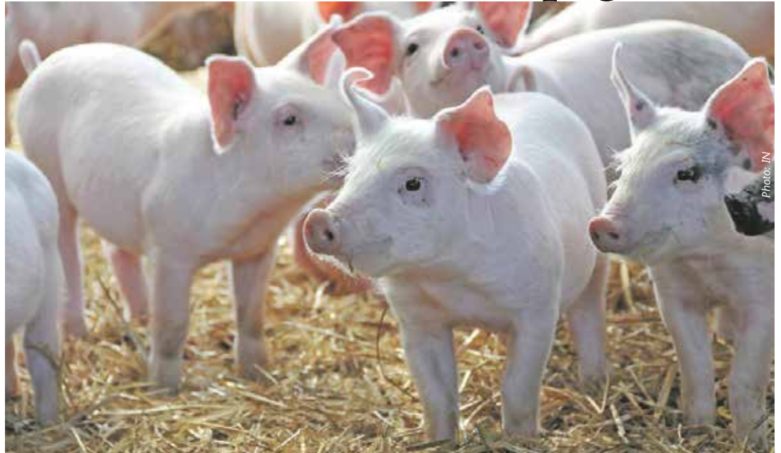
Healthy piglets fed on well formulated feeds mature early