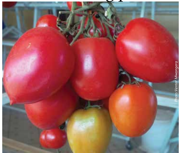
Cherry tomatoes grown within a greenhouse and sprayed with Sodom apple extract to control pest and disease