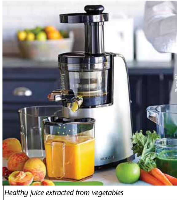
Healthy juice extracted from vegetables

While blending is putting all the fiber and proteins from the