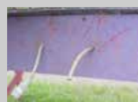
Back side (collection area) of the bin