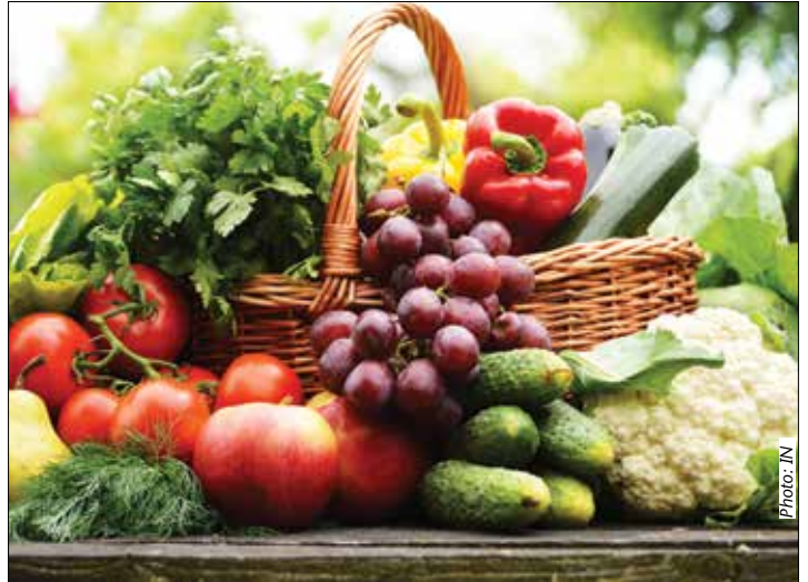
Organically grown vegetables, on sale in an organic store

PGS is the better option for farmers groups. Farmers sell their