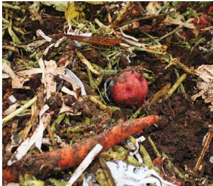
Kitchen waste being recycled into compost manure