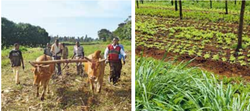
Careful ploughing and crop rotation maintain soil biodiversity.

Biovision provides information on ecological agriculture on the internet. The main target groups in Africa are primarily “multipliers” such as state agricultural advisors, experts from goal-related organisations and farmers’ groups.