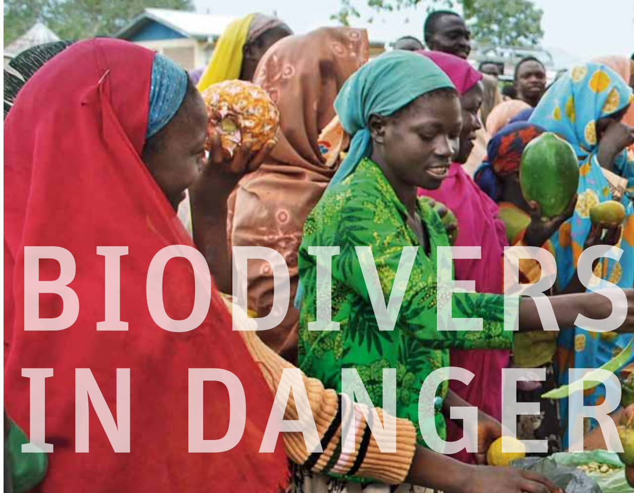
Photo: Market in Assosa, Ethiopia

A high level of biodiversity provides the foundation for our nutrition. If it continues to disintegrate all of us lose out, not just the people of the Southern Hemisphere.