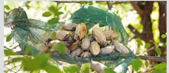
Caterpillar, moth and cocoons of the African silk moth Epiphora bauhiniae , which are kept for silk production under nets on wild acacias.