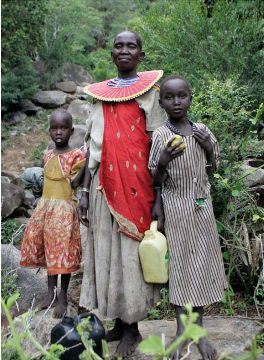
Empowerment of women: In the Cabesi project, the women of West Pokot are actively included in the work and in the decision making process, which strengthens both their self-confidence and their position in a society dominated by men.