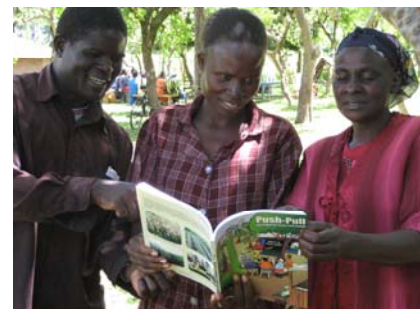
The Push-Pull method is explained clearly with the use of illustrations and other information materials.