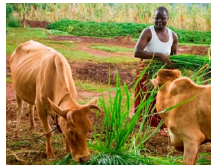
Napier grass from the Push-Pull fields provides welcome additional feed for livestock.