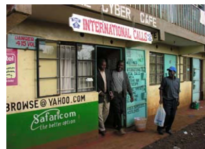
Thanks to the emergence of numerous internet cafes, access to the internet has become much easier.