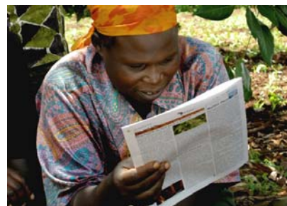
Farmers receive practical guidance from "TOF – The Organic Farmer".