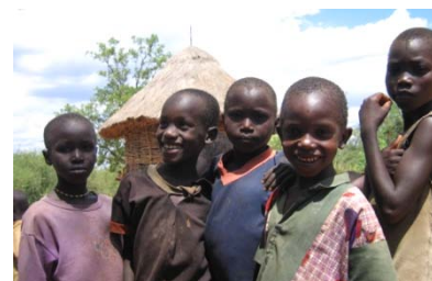
The project helps to generate new sustainable income sources in the region which enable families to pay the school fees for their children.