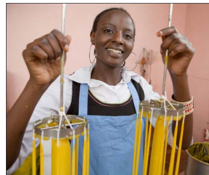
Beeswax used to be seen as a useless byproduct of honey production. Now it is being used to produce candles in the „Cabesi Market Place“.