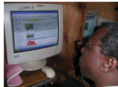
The users learn very quickly how to find the required information on the internet.