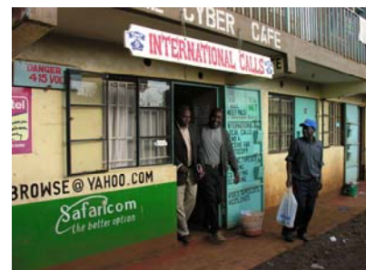
Thanks to the emergence of numerous internet cafes, access to the internet has become much easier.