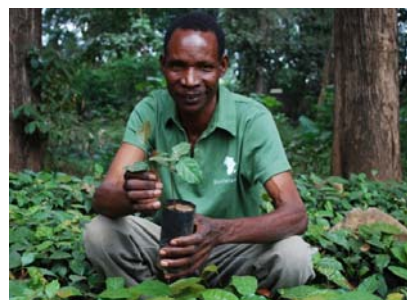
In the school garden, farmers learn and apply new, sustainable farming methods.