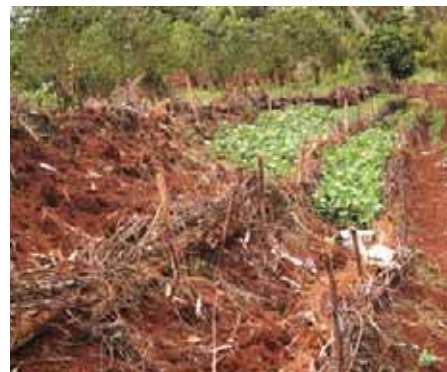
A garden with terraces

Tumbukiza method: In this method, a hole 60 cm and 60 cm wide is dug and filled with compost mixed with soil and planted with maize or Napier grass. Water from run off collects in