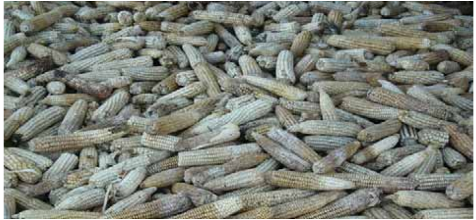
A large portion of maize harvested every year is lost to pests and rotting.

Shelling: Shelling helps to check pest damage. Since most pests prefer maize which is still on the cob for easy movement. If a farmer has to apply pesticides, this should be done after