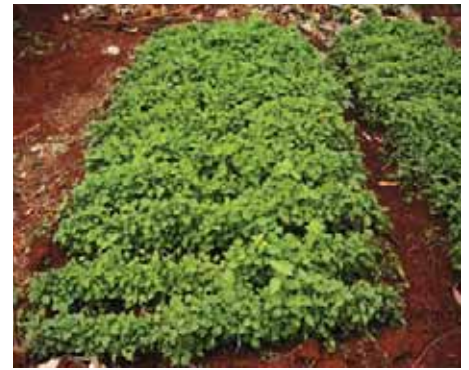
Farmers can propagate their own organic seeds

This starts with making application to KEPHIS and if successful, being granted a Q-license to import, with certain conditions. A Q-license is a quarantine license and comes with the following requirements: Documentation of the origin of the seed must be supplied to KEPHIS and on entering the country, the seed is immediately taken to and tested at the KEPHIS laboratories. If it is seen to be carrying pathogens foreign to our local pathogens, it will be destroyed. From there, germination tests are done and if all goes well, you will be given the seed on certain planting conditions. The entire planting area will be quarantined, which includes 6 foot plastic sheet fencing and foot and car/tractor baths at all entrance and exits. Transfer or sale of the seed is also prohibited. As you can see, as organic producers we are caught between a rock and a hard place. To import following the regulations is expensive, time consuming and risky. To grow