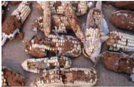
Damage to maize cobs

fore, cultural practices should aim at maintaining or enhancing plant health.