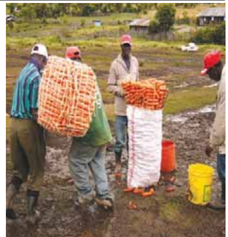
Carrots ready for market