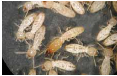
Termites (worker and soldier)

Although healthy plants may be damaged by termites, unhealthy and stressed plants are generally more susceptible to termite attack. There-