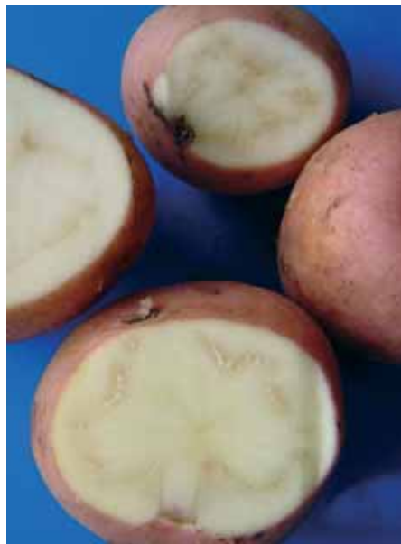
Potatoe farmers incur huge losses due to bacterial wilt

To avoid the development of persistent weeds, slow growing plants should be grown after crops with a good weed suppression. Change crops with deep roots with those that have flat, shallow rooting systems which also helps to suppress the weeds. (See also page 3).