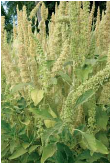
Amaranth improves nutrition (TOF)

Planting can be done direct from the seeds. However, because Amaranth has a deep and wide hairy root structure, it will battle for nutrients if grown with very close spacing. My